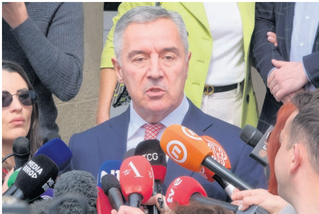
Pro-Western incumbent Milo Djukanovic speaks to journalists after casting his ballot at the polling station in Montenegro's capital Podgorica, Sunday, March 19, 2023.

Djukanovic, who has held Montenegro's largely ceremonial presidency since 2018, won the most votes in the first round of the country's presidential election,